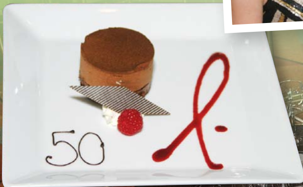
For dessert? Triple chocolate mocha torte with a message! v