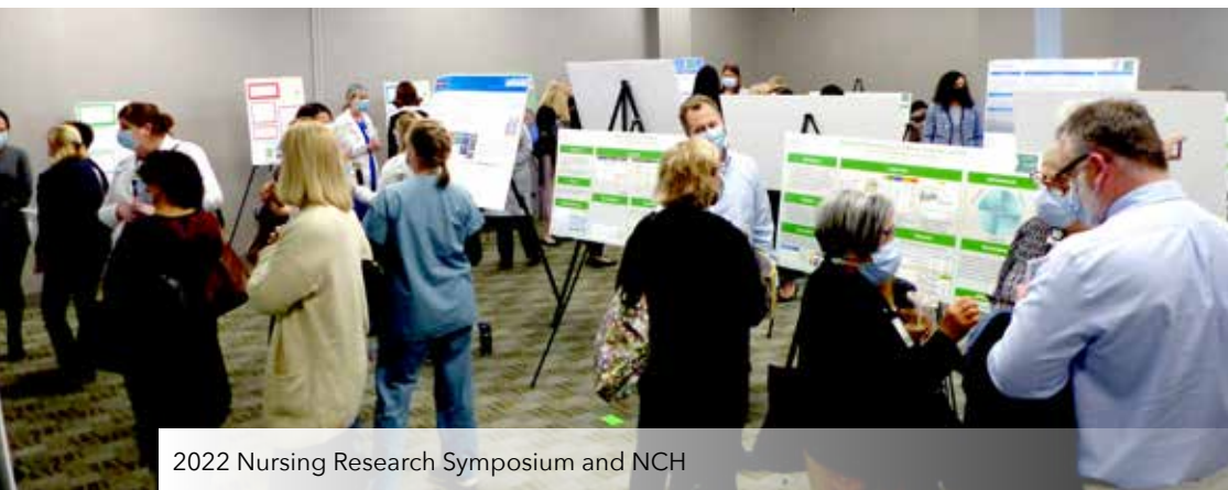
2022 Nursing Research Symposium and NCH