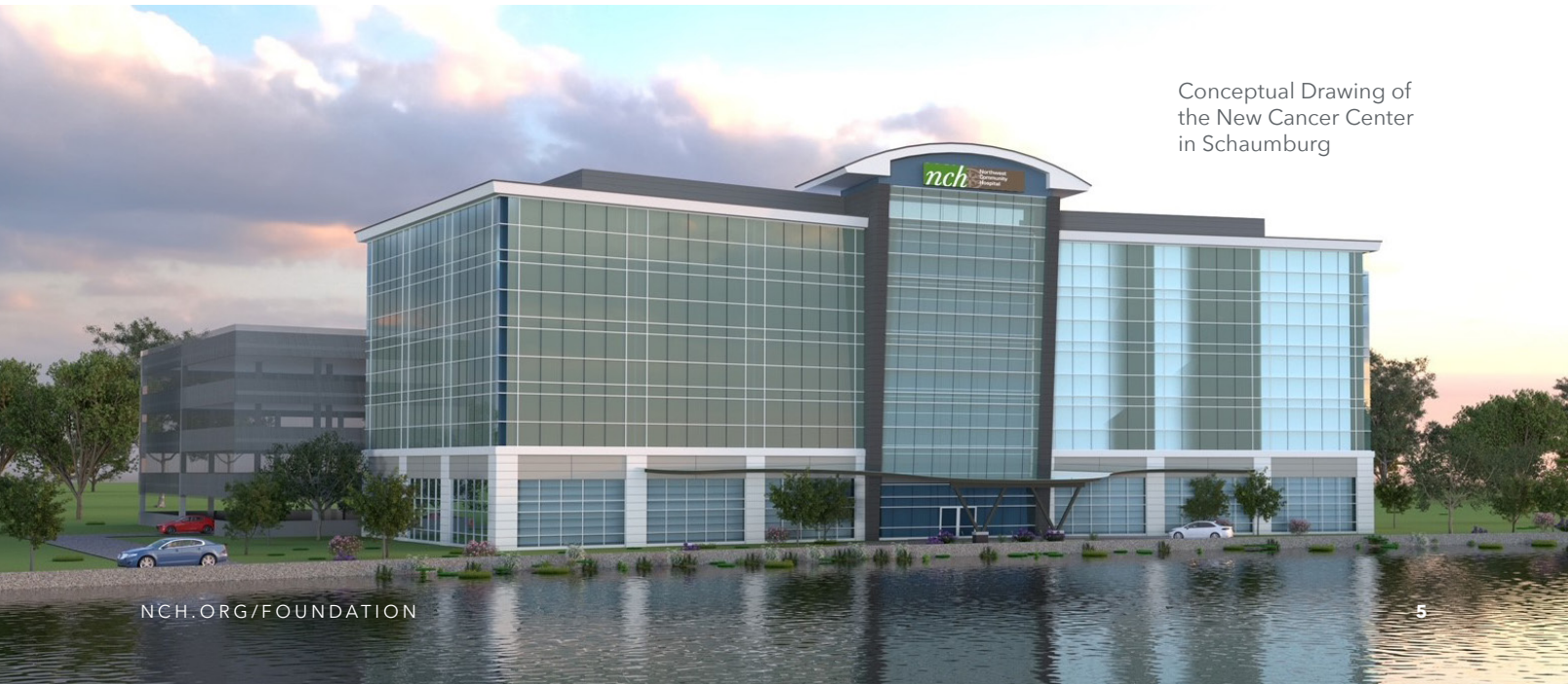
Conceptual Drawing of the New Cancer Center in Schaumburg

Plans for a new NCH Cancer Center have continued this year with state and local approvals. Located at the site of the former Motorola headquarters and easily visible and accessible from Meacham Road and I-90, the Cancer Center will total 105,000 square feet. The Cancer Center is being designed with extensive input from physicians, nurses, and community members to create an ideal space for procedures, equipment, technology, research and education. The design is also flexible and expandable to ensure NCH is prepared to meet the needs of the future. A formal groundbreaking will take place in the spring of 2023.